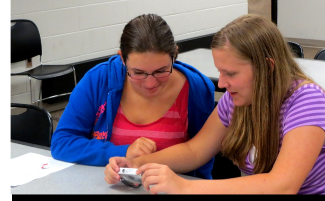
Students Learning Digital Photography

-No, the program is open to the first 20 students in attendance for each day (there will be no pre-registration).