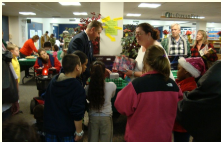
The drawing begins!

The winners and participants of the library fundraiser tea cup drawing.