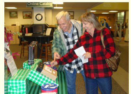
The lucky ticket?