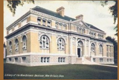
Library of the New Britain Institute, New Britain, Conn.